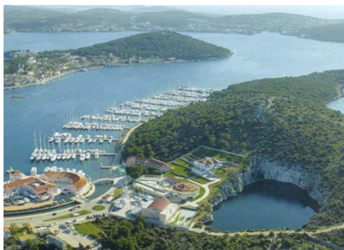
Fig. 1. Airphoto of Rogoznica Lake, Central Dalmatia.

climate is Mediterranean, with warm summer and mild winter periods with average temperatures of 8-10°C during winter. The whole region is characterized with extensive tourism, with a low impact of industrial activities.